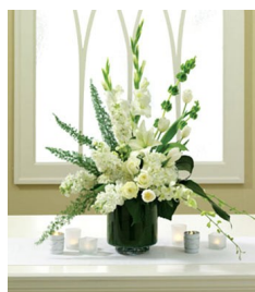
Altar flowers this week are to the Glory of God

We will have the next Council Meeting on Tuesday, November 13, 2018 at 7:00pm.